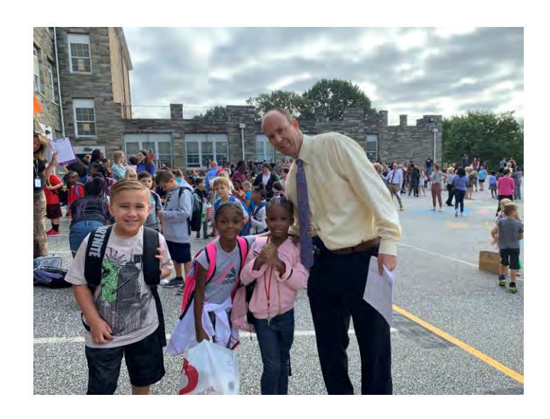
FIRST DAY OF SCHOOL